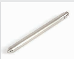
Long probe, Part No. 03-1326