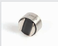
Magnet, Part No. 03-1327

*Please see www.easylaser.com for compatible models.