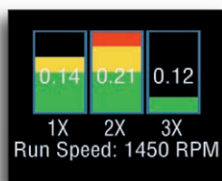
Display on vibrometer unit. Analyze.